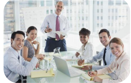
Appropriate For: HR Professionals at any phase in their careers.

To discuss options for bringing Business Savvy for HR Professionals in-house for your team, contact us at info@mariemoran.com or call 888-284-2442. Thank you!